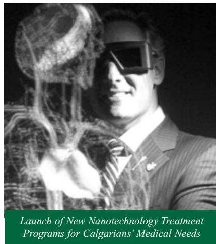
Launch of New Nanotechnology Treatment Programs for Calgarians’ Medical Needs