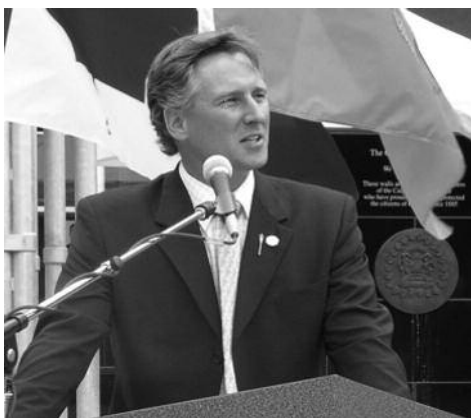
Provincial/Federal New Safe Communities Announcement.