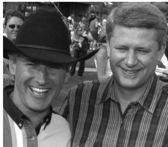
With Prime Minister Stephen Harper at Hull Home’s Stampede Breakfast.