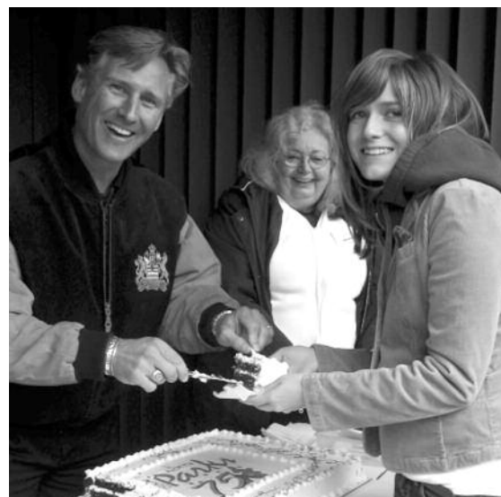
At our Annual “Picnic in the Park”, after MCing the Re-opening of Fish Creek Park.