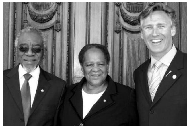
With Ambassador Friends from Africa.