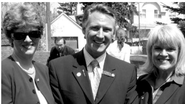
With Ministers Finley and Evans at the Signing of the Historic Federal/Provincial Immigration Agreement.