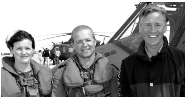
With Our Soldiers Serving Overseas...