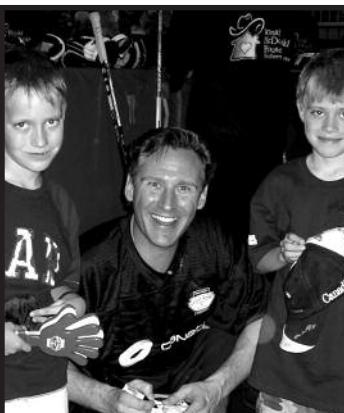
Celebrity Street-Hockey for Ronald MacDonald House.