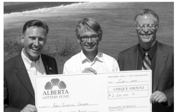
Announcing AB’s $2.5 Million Commitment to Replace the Calgary Weir (Safety/Quality of Life).