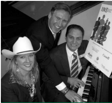
Announcing Calgary as the 2008 JUNO Awards Host City.