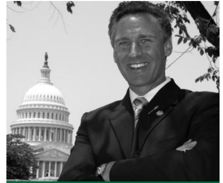
At the Capitol Building, Washington DC (after Meetings with International Officials).