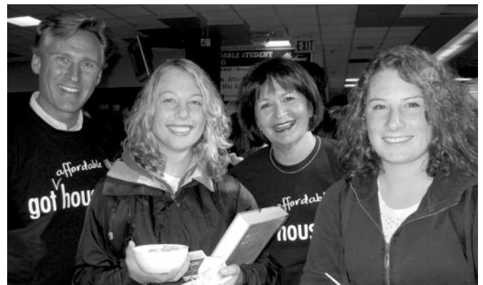
Youth at “U of C’s Affordable Housing Panel”.