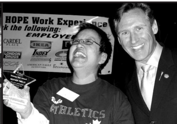
Hull Home “Brighter Tomorrow” Awards.